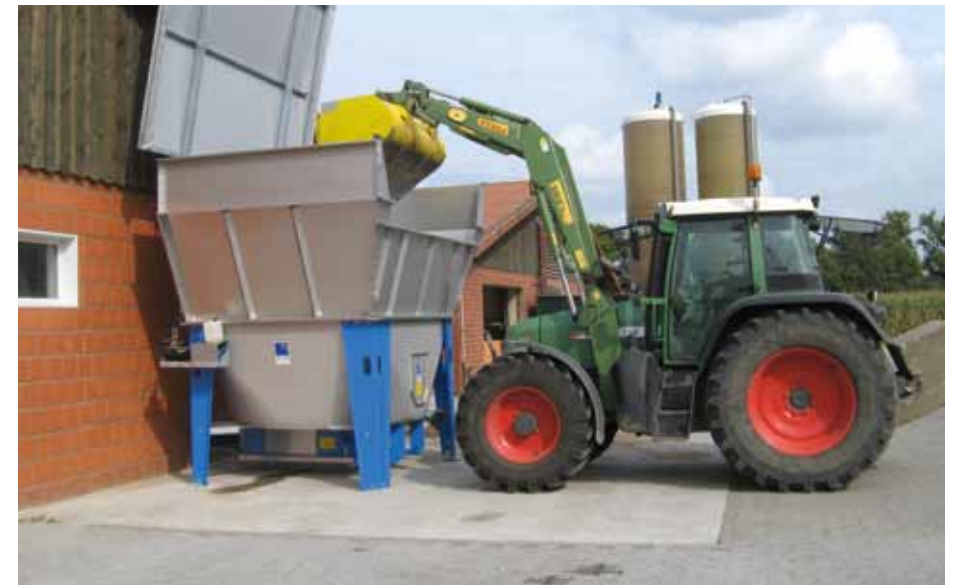
UNI-Dos model 200 with 20 m 3 storage volume, horizontal discharge screw model 160 and hydraulically operated cover