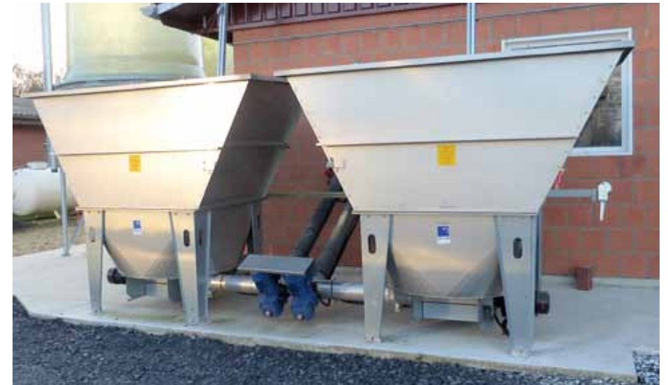
2 UNI-Dos model 45s made from stainless steel with 3.2 m 3 storage volume, horizontal discharge screw model 160, stainless steel cover with hand crank